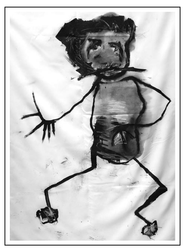
SIN TÍTULO, 2003 Acrílico sobre papel, 95 x 70 cm.