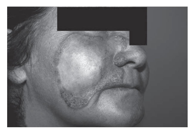
Fig. 3 Plaque lesion of chromoblastomycoses involving the face.

In the semiarid states of Venezuela, the most prevalent causative organism is C. carrionii , especially in men who care for goats [29]. From 1992–2004, 22 children and adolescents (aged 2–19 years) living in the semiarid zone of Falcón state were diagnosed with chromoblastomycosis caused by C. carrionii [47]. However, in more humid states, including Táchira, Trujillo, Mérida, and Miranda, most cases were caused by F. pedrosoi [29].