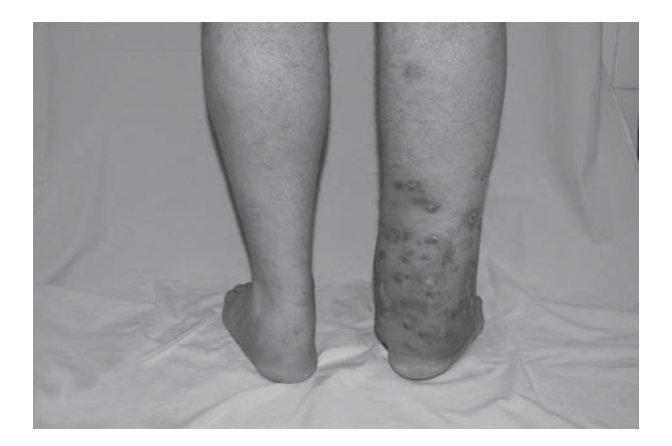
Fig. 2 Leg and foot multifistulous lesions of eumycotic mycetoma caused by Scedosporium apiospermum .

In Brazil, the mean annual numbers of cases of chromoblastomycosis reported were 6.4 (71 cases/11 years) for Paraná (South Region), 5.9 (325 cases/55 years) for Pará (North Region), 4.3 (13 cases/3 years) for Maranhão (Northeast Region), and 2.6 (73 cases/28 years) for Rio Grande do Sul (South Region) [1]. Of the 78 caustive agents identified in a retrospective study of 325 cases reported in Pará from 1942–1997, 77 were F. pedrosoi [42]. This fungus was also the causative organism in 9 of 13 patients treated in Maranhão between 1988 and 1991 [44]. A potentially important source of infection in the Amazon Region of Maranhão is the harvesting and processing of