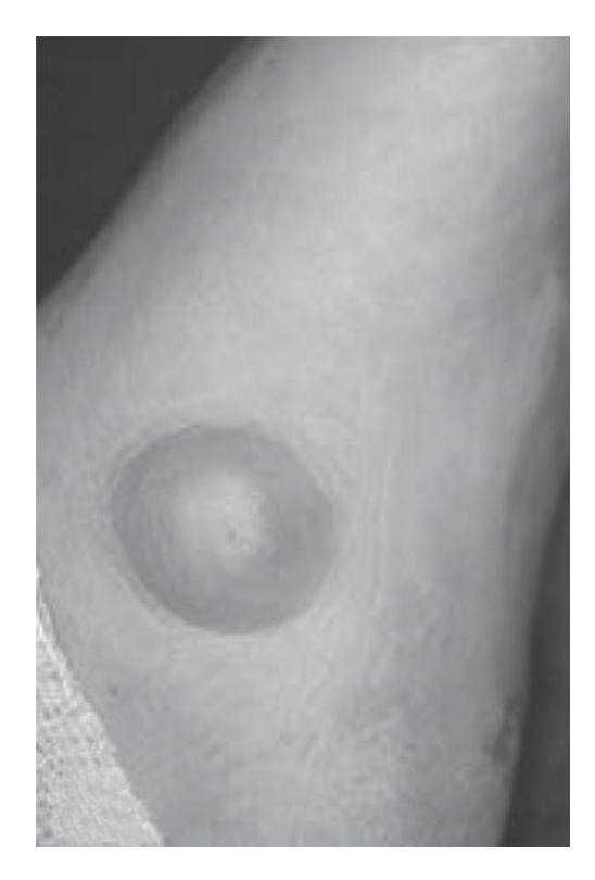
Fig. 4 Cystic lesion of subcutaneous phaeohyphomycosis on the foot of a renal transplant recipient.

Lacaziosis, or lobomycosis, is caused by Lacazia loboi (formerly called both Loboa loboi and Paracoccidioides loboi ), a fungal pathogen that affects humans and dolphins [79,80]. This fungus has never been isolated in cultures. In most cases, the agent is probably introduced directly into the dermis through a penetrating entry, such as an insect bite or thorn prick [3]. Although the natural reservoir of L. loboi is unknown, its likely habitat is somewhere in the