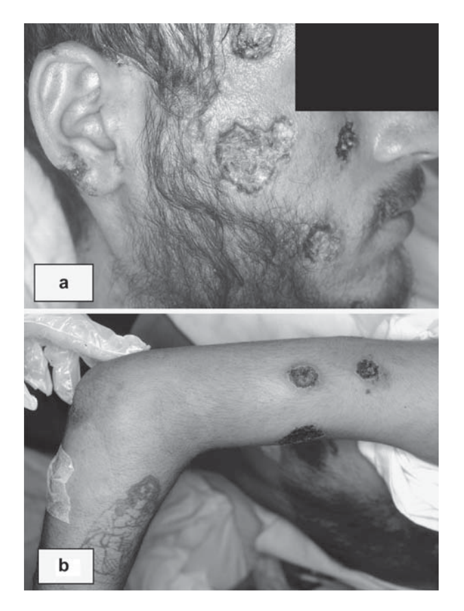
Fig. 1 Disseminated cutaneous sporotrichosis in a patient with AIDS on (a) the face, and (b) the arm.

50-year-old men, with male-to-female ratios of 5:1 and 9:1 reported [37,42].