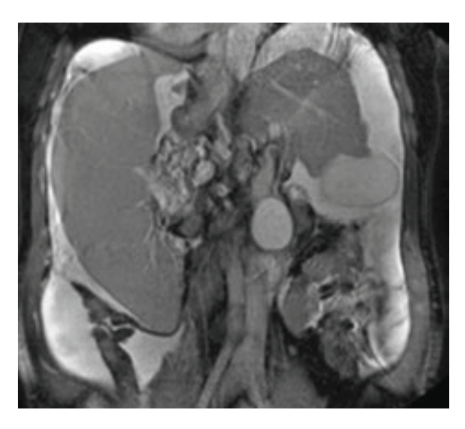
Figure 1. Magnetic resonance imaging of the patient prior to liver transplantation. The image shows SI of abdominal organs without any significant vascular abnormalities. The liver was small and cirrhotic without any liver masses and there was evidence of portal hypertension with splenomegaly.

During the operation positioning of the graft was best fitted by rotating it 90 degrees to the left, thereby pointing the left lobe towards the left lower quadrant and the right lobe in the recipient hepatic fossa on the left upper quadrant of the abdomen ( Figure 3 ) as previously described by Klintmalm et al.<sup>17</sup> The suprahepatic vena cava of the graft was oversewn and the donor infrahepatic vena cava was sewn end-to-side to the recipient vena cava ( Figure 3 ). An end-to-end portal vein anastomosis was performed with successful reperfusion of the graft after removal of clamps. A vascular graft using the donor iliac artery was performed