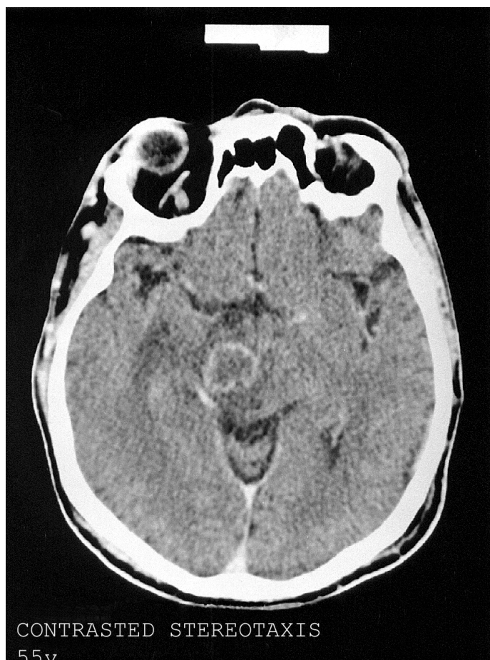
Fig. 1 - CT brain scan at diagnosis showing a ring-enhancing lesion in the right mesencephalon with mass effect and peri-lesional edema.

Neurological examination disclosed that the patient was conscious, had a highly preserved cortical function and his memory was also normal.