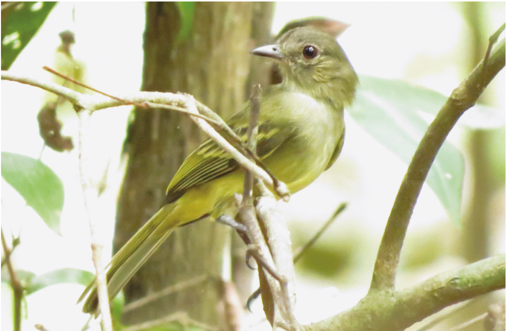
Figure 2. Yellow-crowned Elaenia Myiopagis flavivertex , Playa Alta, municipality of Puerto Concordia, dpto. Meta, Colombia, January 2017 (Wilmer A. Ramírez)