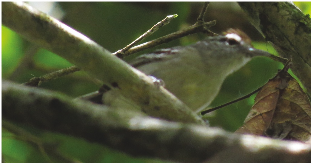
Figure 4. Female Dugand’s Antwren Herpsilochmus dugandi , near Caño Negro, Buena Vista II, municipality of San José del Guaviare, dpto. Guaviare, Colombia, July 2016 (Wilmer A. Ramírez)

The species was identified by its vocalisations and plumage differences, especially in females, from Spot-backed Antwren H. dorsimaculatus . The latter species has similar plumage but differs vocally, and has recently been recorded in both Vaupés and Guainía