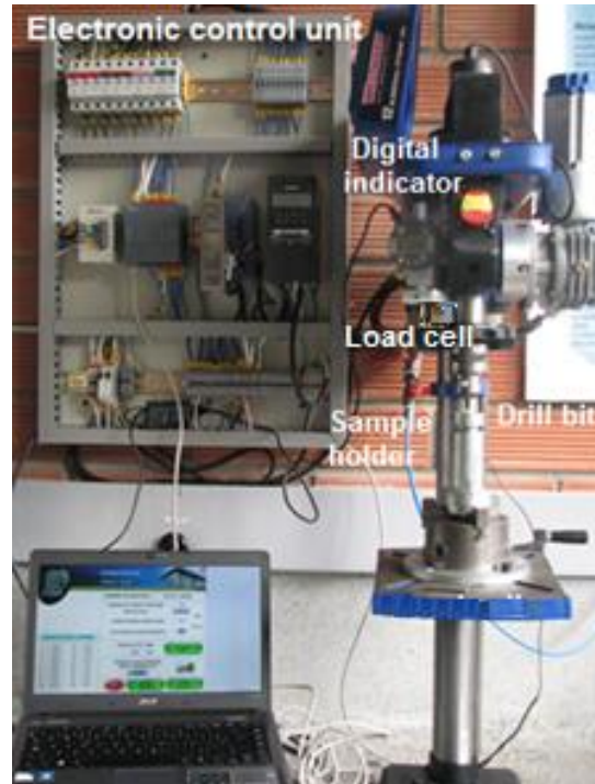
Figure 1. Instrumented bench drill.

On the other hand, the drilling tests were realized with a pyramidal tungsten carbide drill bit using the instrumented bench drill showed in Figure 1, which applied slowly an incremental force to a maximal load (approximately 100 N) and then the force was decreased to zero using a load and unload speed of 0.15 mm/s in order to obtain the hysteresis graphics (Force Vs Indentation Depth).