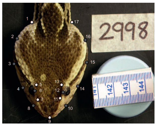
Figure 1. Fixed (white circles) and sliding (gray circles) landmarks used in this study to quantify head size and head shape in Mapaná snakes ( Bothrops asper ) (modified from Smith and Collyer, 2008).

of the head, which improves fitting of the contour. All landmarks were then subjected to a Generalized Procrustes Analysis, which consists of superimposing all landmarks in a coordinate system while holding constant variation due to position, orientation, and size (Rohlf and Slice, 1990). From this analysis we obtained 14 shape variables that provided a multivariate and size-free shape description of the head shape of each animal, and a univariate measure of head size (centroid size; see Bookstein, 1991). Finally, with the objective of visualizing head shape differences among groups, the average shapes were calculated and graphed. Morphometric analyses were performed with tpsDig, tpsRelw, and tpsSplin software (Rohlf, 2001; 2003; 2004).