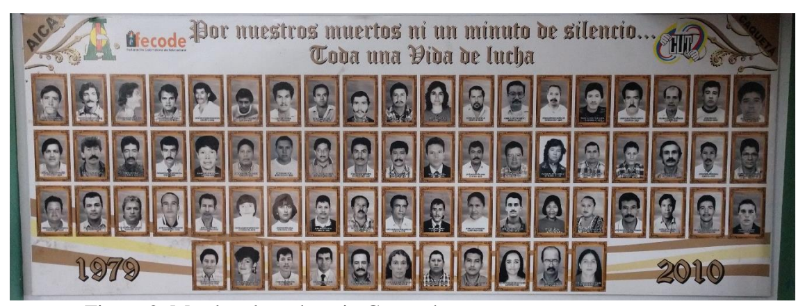
Figure 2. Murdered teachers in Caquetá.

different armed groups had influence and civilians became involved in the conflict since armed actors occupied houses and schools (CNMH, 2013; Semana, 2009). This armed conflict caused more than 1860 families were displaced from their homes from 2002 to 2012. Finally, teachers as relevant actors in rural areas were affected in different ways by this conflict. Teachers' union of the department reported more than 100 hundred teachers killed (CNMH, 2013). The figure 2 represents some of the members of the teachers' union of the department that had been murdered by national army, paramilitary forces, and guerrilla groups. Most of the teachers were killed due to their active role in their community or to their political beliefs. The photo was taken in one of the visits to the department.