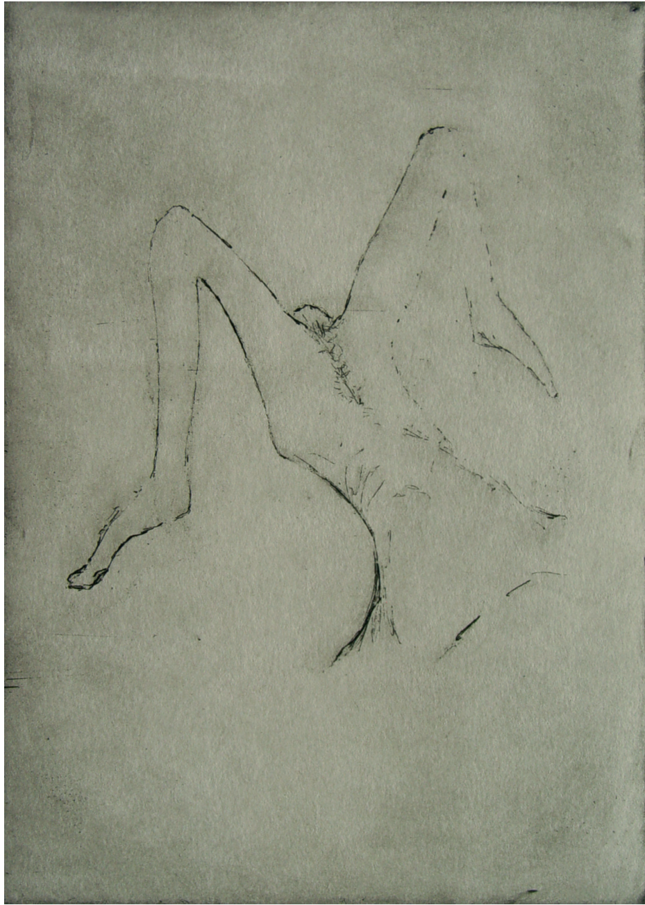
Sexe Grabado, 9 x 12 cm