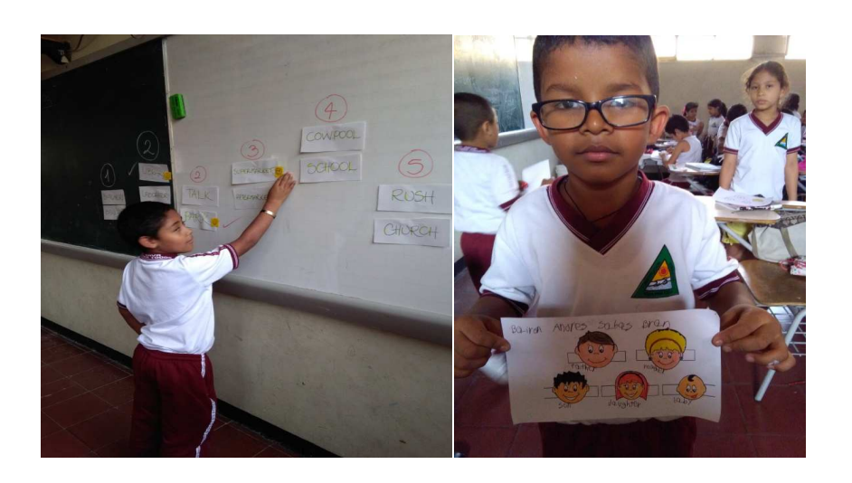
Appendix 5 (Class Report and Reflection)