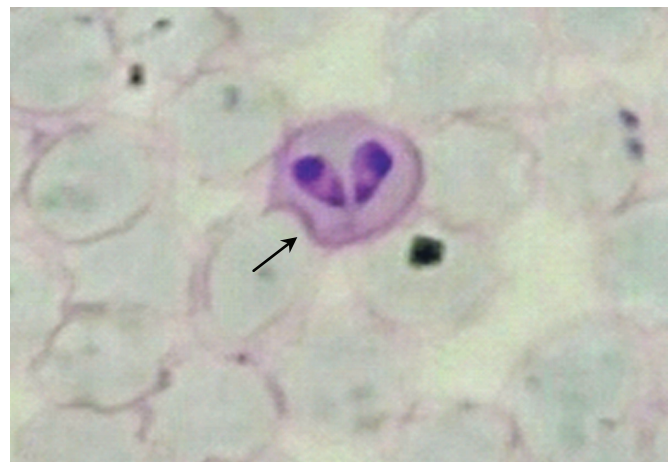
Fig. 2: Babesia bigemina in a Giemsa stained blood smear from a bovine (Urabá, Colombia). Pear-shaped B. bigemina inside a red blood cell (arrow).

Figures in parentheses indicate percentages.