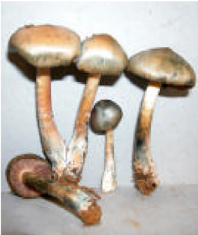
Figura 1. Psilocybe bispora , basidiomata (holotype).

walled and subellipsoid thin-walled does not fit in any of the accepted caerulescent sections known (Guzmán, 1995, 2004). According to Guzmán (1995) and Noordeloos (2001) the form of basidiospores and the thickness of their wall are important taxonomic features in Psilocybe , and for Guzman (1995) this is the base of the division of the genus in sections. Thus the following new section is proposed to accommodate this new species.