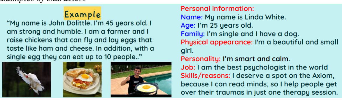
Figure 2 Examples of characters

Note: Creation of characters for role-play