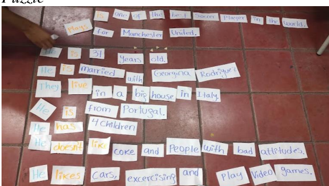
Figure 1 Puzzle

activity, I wrote Shakira's biography on the board with simple sentences mainly using the verb to-be. I underlined the nouns with one color and the verbs with another color. We read them together. And most of those in the room understood what the paragraph was about. For the second part of the activity, we