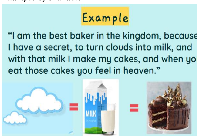
Figure 4 Example of character

Note: Example used to illustrate the students in the creation of the character for the role-play