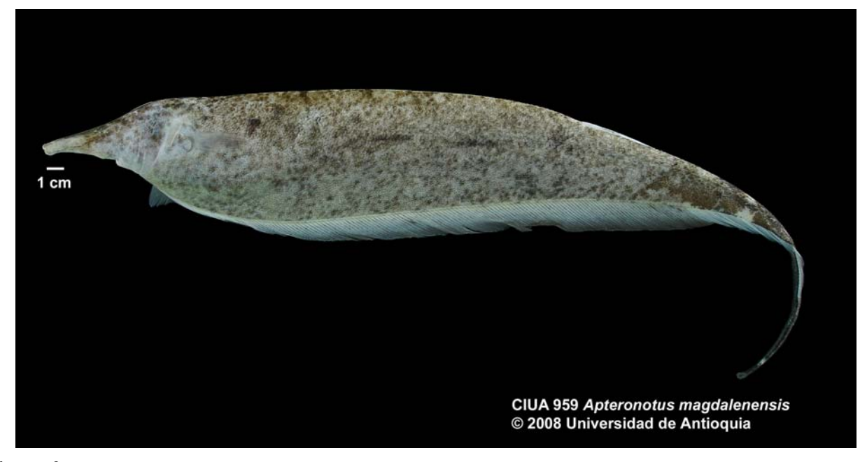
Figure 2. Apteronotus magdalenensis, CIUA 959 (SL 364 mm) on an island of the Magdalena river.

The local fishermen who helped us collect these specimens call A. magdalenensis "el original perro" (which translated means "original dog"). In other parts of the river it is called "caballo" (horse) or "perrita" (little dog). They told us that it is a rare but not unknown fish. In the town of Berrio they reported that very large ones are sometimes eaten, but in the Sogamoso river they are used for bait to catch large Tiger Catfish (Pseudoplatystoma magdaleniatum Buitrago-Suarez & Burr 2007). Additional field work will probably reveal that some fish we now consider to be rare, especially those described long ago such as this one, are more abundant than is commonly thought. However, although more extensive collecting is needed to find populations of seemingly scarce fishes, the Magdalena basin desperately needs efforts to guarantee its conservation. Poor land management practices associated with agriculture, cattle ranching and urban development have led to heavy erosion and sedimentation of the river (Galvis and Mojica 2007), and high levels of contamination from sewage, fertilizers and toxic chemicals. Apteronotus magdalenensis populations have undoubtedly suffered, but numbers remain their population unknown (Mojica and Castellanos 2002). few specimens known of this species indicate that it remains one of the most vulnerable species endemic to the basin.