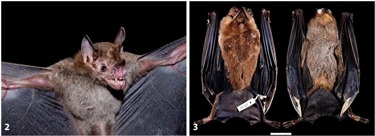
Figures 2, 3. Pale-faced Bat, Phylloderma stenops , adult female (CSJ-m 995). 2. Individual captured at Parque Nacional Natural Las Orquídeas, Colombia. 3. Skin of same specimen; scale bar = 25 mm.

the length of the foot, and the tail reaches only half of the inter-femoral membrane (Fig. 3) (Husson 1962, Barquez and Ojeda 1979, Emmons and Feer 1999, Williams and Genoways 2008, Reid 2009, Díaz et al. 2011, Díaz et al. 2016). Although the species seems to be easily identified, specimen ICN 4465 identified by Ramírez-Fráncel et al. (2015) as P. stenops , was re-identified by us as Phyllostomus elongatus (É. Geoffroy St.-Hilaire, 1810). As previously mentioned, the species is not uncommonly misidentified with members of the genus Phyllostomus . Nonetheless, our examined material of P. stenops can be easily differentiated from the former genus using dental characters: while Phylloderma has 3 lower premolars (the second of which is small and labially oriented) the genus Phyllostomus has only 2 premolars similar in size (Figs 4, 5) (Husson 1962, Emmons and Feer 1999, Williams and Genoways 2008).