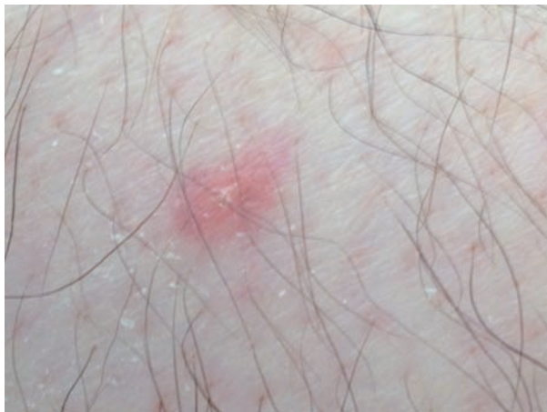
Figure 1. A 5 mm erythematous papule with white scaling in the center

Histopathology of skin lesions was positive and immunohistochemistry for toxoplasmosis confirmed the presence of the parasite (figures 2 and 3). Molecular studies with blood and cerebrospinal fluid (CSF) PCR were also positive for Toxoplasma (7). Central nervous system magnetic resonance (MR) did not show focal lesions.