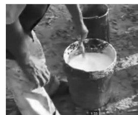
Activity 3: Filtering and dilution of latex