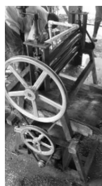
Activity 4: Rolling