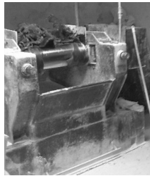
a) Mixing in the open rolls mill