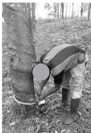
Activity 1: Tapping. In this image the cut is performed near the ground

located on each tree and gather the latex in drums to facilitate their transport to the latex treatment area where next activity is carried out, as shown in Figure 1.