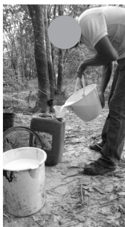
Activity 2: Latex collection in drums