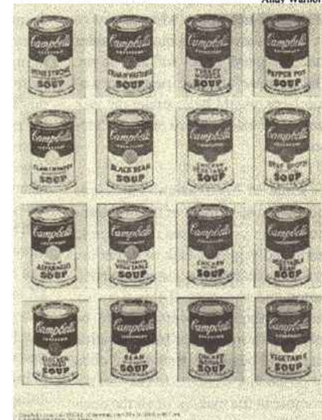
Campbell's soup cans (1961-1962) Andy Warhol

Before asking students to evaluate their performance it is necessary, however, that students have a clear idea of which aspects to consider. These aspects or parameters can be defined with the help of the teacher