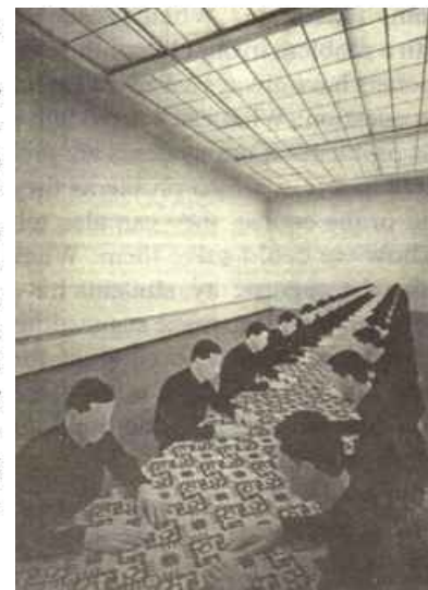
Tischgesellschaft (1988) Katharina Fritsch