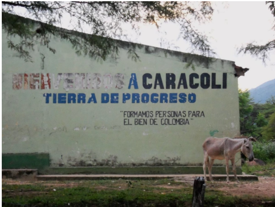
Figure 3: A house in the town in Caracolí. The sign reads: "Welcome to Caracolí. Land of progress. 'We shape people for the good of Colombia'."

programs, compensation and in the case of Caracolí, on tourism as an expected consequence of the dam and an opportunity for diversifying sources of income