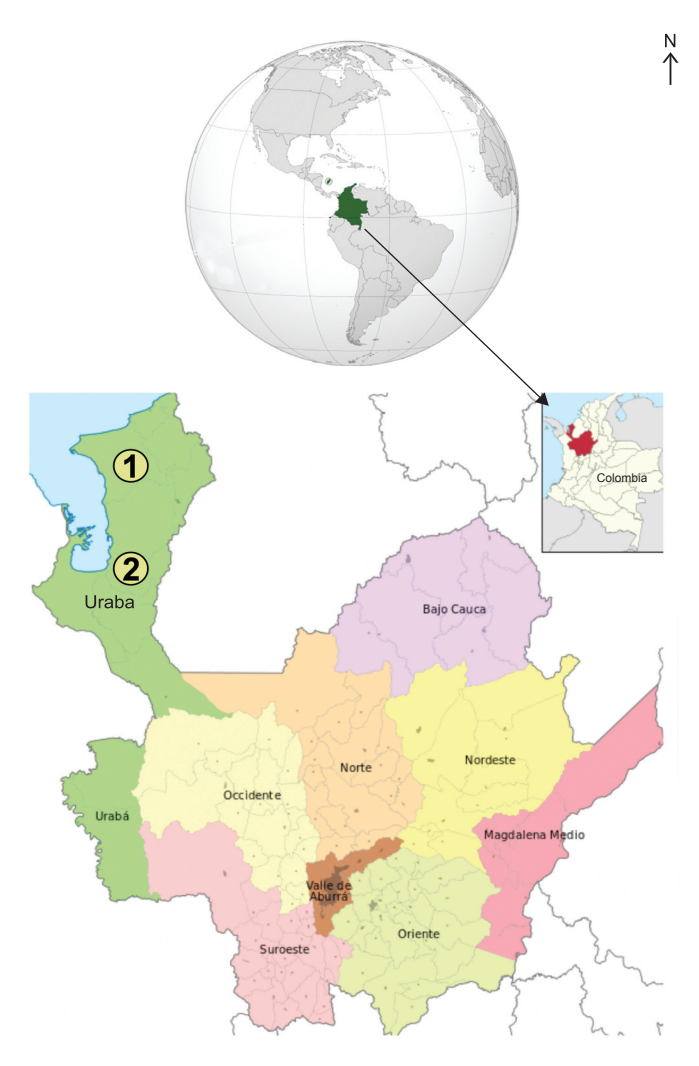
Fig. 1: Location of sampling sites in the Urabá region (green area), Antioquia, Colombia—① Necocli; ② Turbo.

Sample size (n) for bovine and human populations was estimated according to Lwanga et al <sup>18</sup> and using the Epidat program (version 4.1), on the basis of the following data/criteria. For bovines: Total population = 280,767 (records of the Department of Agriculture of the Department of Antioquia in 2014 for both towns<sup>16</sup>), prevalence of babesiosis = 13.65% (the median of frequencies reported in Colombia<sup>9, 19</sup>; and sampling error = 5%. For humans : People related to livestock activity<sup>16</sup> = 2559; prevalence