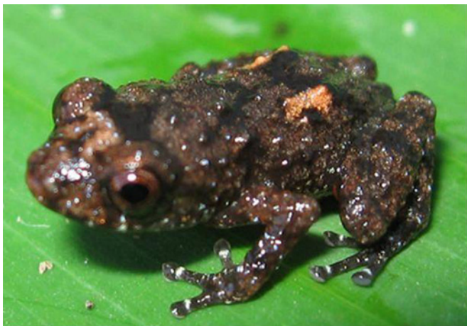
FIGURE 1. Diasporus anthrax collected in Natural Refuge Rio Claro, Municipio de San Luis, Departamento de Antioquia, Colombia. MHUA-A 5877

Diasporus anthrax Lynch, 2001, is a small frog endemic to Colombia (Figure 1), inhabiting the tropical humid forests of the northern Cordillera Central, at the Magdalena's river valley from 280 and 1200 m elevation (Lynch 2001; Savage 2002; Acosta-Galvis et al. 2006). It is characterized by the presence of an oval palmar tubercle and reddish coloration on the thighs and over the back of the humerus (Lynch 2001). The species has been reported from the Departamento de Caldas (municipios La Dorada and Norcasia), and from the Departamento de Antioquia (municipios de San Luis and San Rafael) (Lynch 2001; Acosta-Galvis et al. 2006; Figure 1).