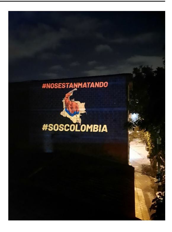
Fig. 2 Light projection photography. Date: May 21, 2021

abuse, and on the other hand, to demand access to education, employment and appropriate living conditions and dignity for all.